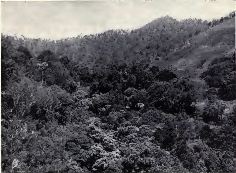
FIG. 80. Rain-forest-like timber in center foreground, open niaouli woods in left background. Such areas are often chosen for camp sites by Pteropus . Dumbea Pass, New Caledonia.

numbers. The account pertains primarily to ornatus . When the camp was first visited on October 23 (spring season), between 15 and 25 flying foxes were present. On October 29, only one animal was found. On January 19, only two animals were present; but by March 31 (fall season), approximately 50 animals were occupying